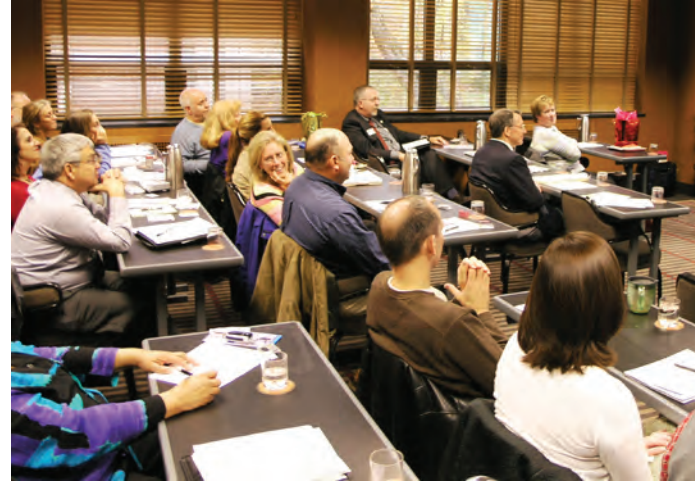
In the classroom at the Kellogg Center in East Lansing on November 8th – the largest meeting attendance of the year!