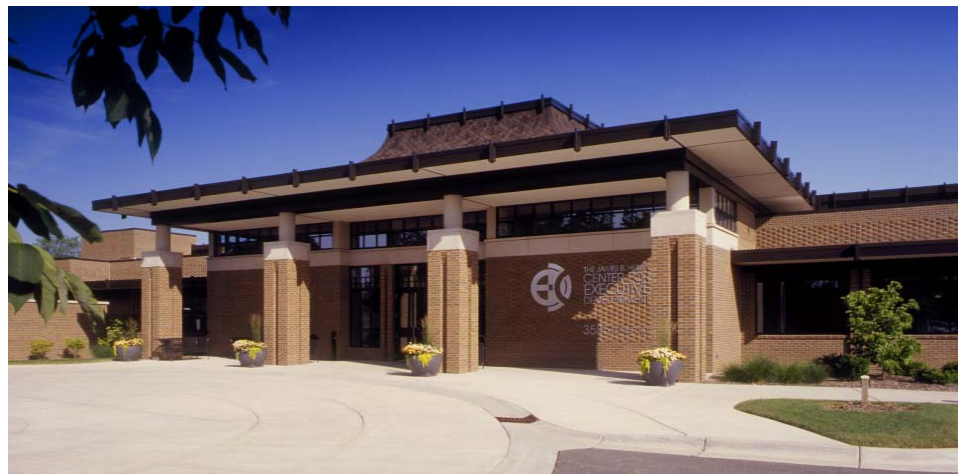
The James B. Henry Center for Executive Development - Michigan State University.